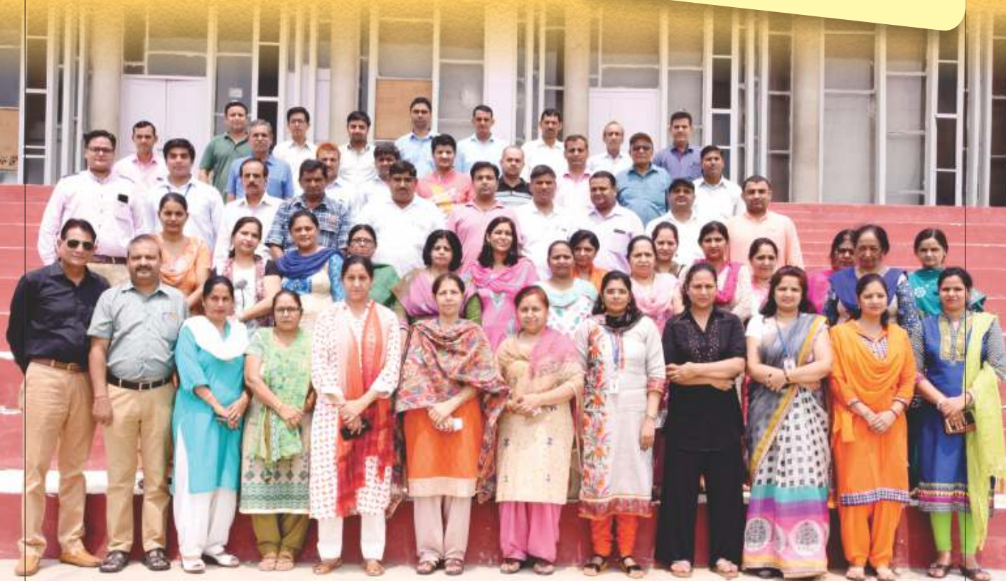
Team of Directorate of Distance Education, Kurukshetra University, Kurukshetra

To evolve a seamless system of higher distance education for sustainable life-long learning and up gradation of knowledge and skills by use of innovative approaches.